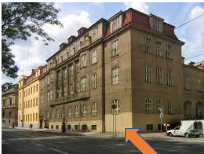
Faculty of Nuclear Sciences and Physical Engineering, Czech Technical University in Prague, Břehová 7, Prague Old Town

There are good train connections between Prague and other European cities. If you arrive by train, you will travel to the city center from Prague Main Railway Station. The venue is within (longer) walking distance from the station. If you prefer, you can take metro C line (red line) in the direction Háje and change at Muzeum station to line A (green line) towards Nemocnice Motol. The venue is located at the metro station Staroměstská on line A. There are also several tram lines nearby the Main Railway Station but the connection to the venue is not direct.