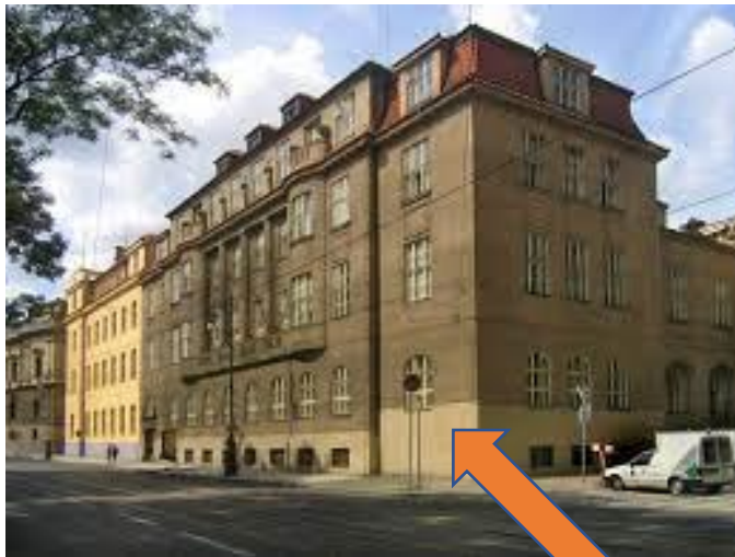
Faculty of Nuclear Sciences and Physical Engineering, Czech Technical University in Prague, Břehová 7, Prague Old Town

There are good train connections between Prague and other European cities. If you arrive by train, you will travel to the city center from Prague Main Railway Station. The venue is within (longer) walking distance from the station. If you prefer, you can take metro C line (red line) in the direction Háje and change at Muzeum station to line A (green line) towards Nemocnice Motol. The venue is located at the metro station Staroměstská on line A. There are also several tram lines nearby the Main Railway Station but the connection to the venue is not direct.