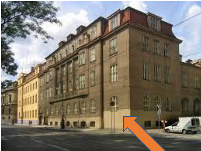
Faculty of Nuclear Sciences and Physical Engineering, Czech Technical University in Prague, Břehová 7, Prague Old Town

There are good train connections between Prague and other European cities. If you arrive by train, you will travel to the city center from Prague Main Railway Station. The venue is within (longer) walking distance from the station. If you prefer, you can take metro C line (red line) in the direction Háje and change at Muzeum station to line A (green line) towards Nemocnice Motol. The venue is located at the metro station Staroměstská on line A. There are also several tram lines nearby the Main Railway Station but the connection to the venue is not direct.